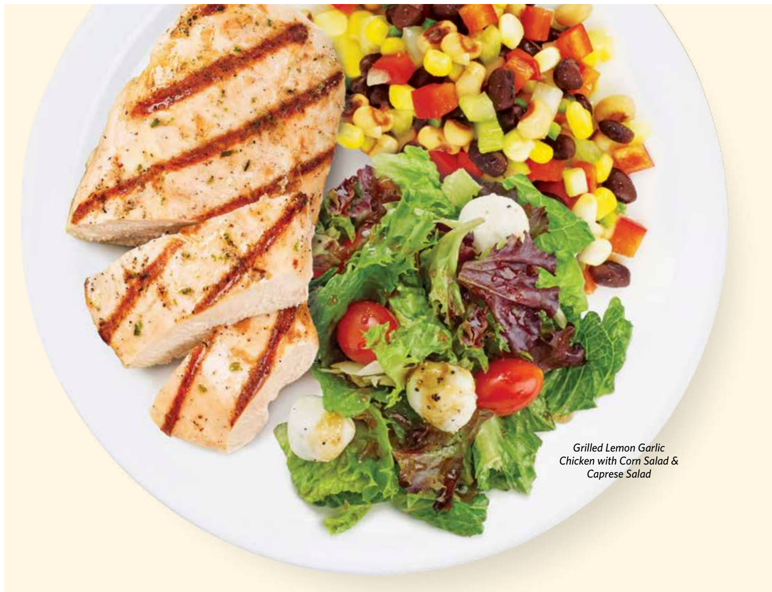
Grilled Lemon Garlic Chicken with Corn Salad & Caprese Salad